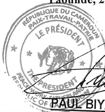
PAUL BIYA PRESIDENT OF THE REPUBLIC