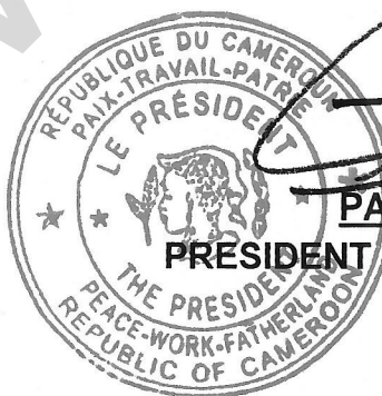
PAUL BIYA PRESIDENT OF THE REPUBLIC